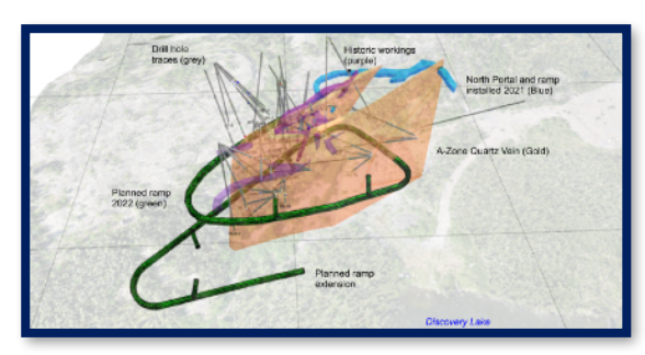
View looking northwest